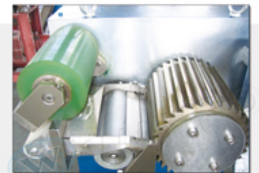
Cantilever Pelletizer 悬臂式切粒机