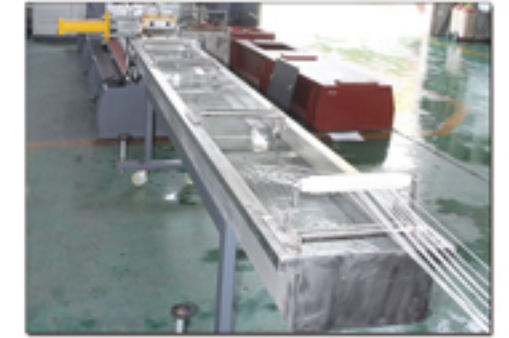
Water Tank 水槽