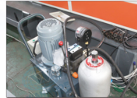
Hydraulic Oil Pump 液压站

The above is just for reference, the real capacity or specifications dependent on your exclusive material.