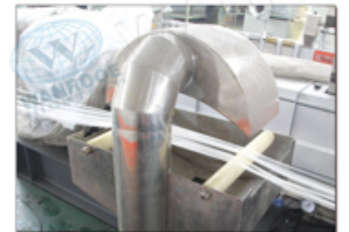
Drying Blower 吹干机